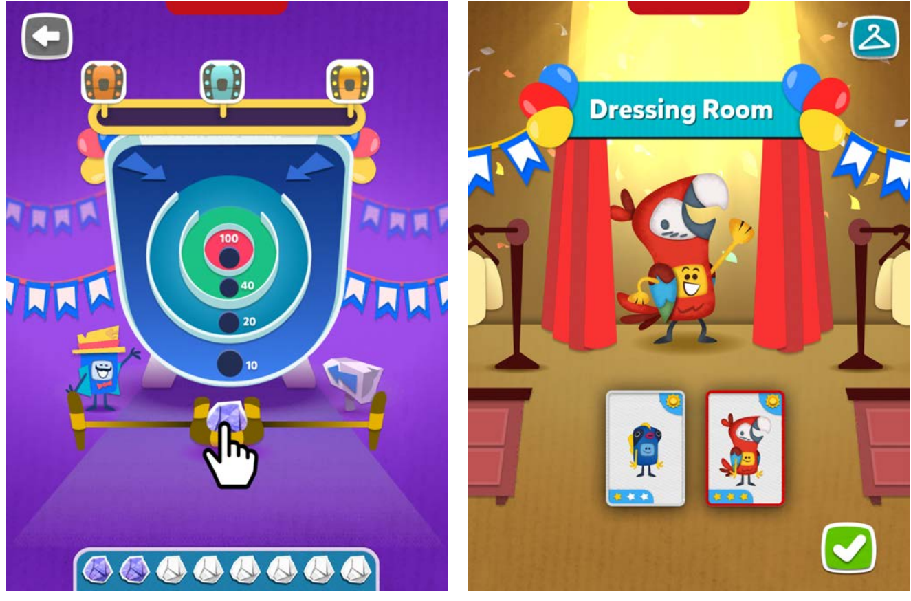
Aim and get a highscore.

Note: There are 10 costumes to collect in each season, and some are more rare than others. Keep playing and replaying seasonal maps to collect them all!