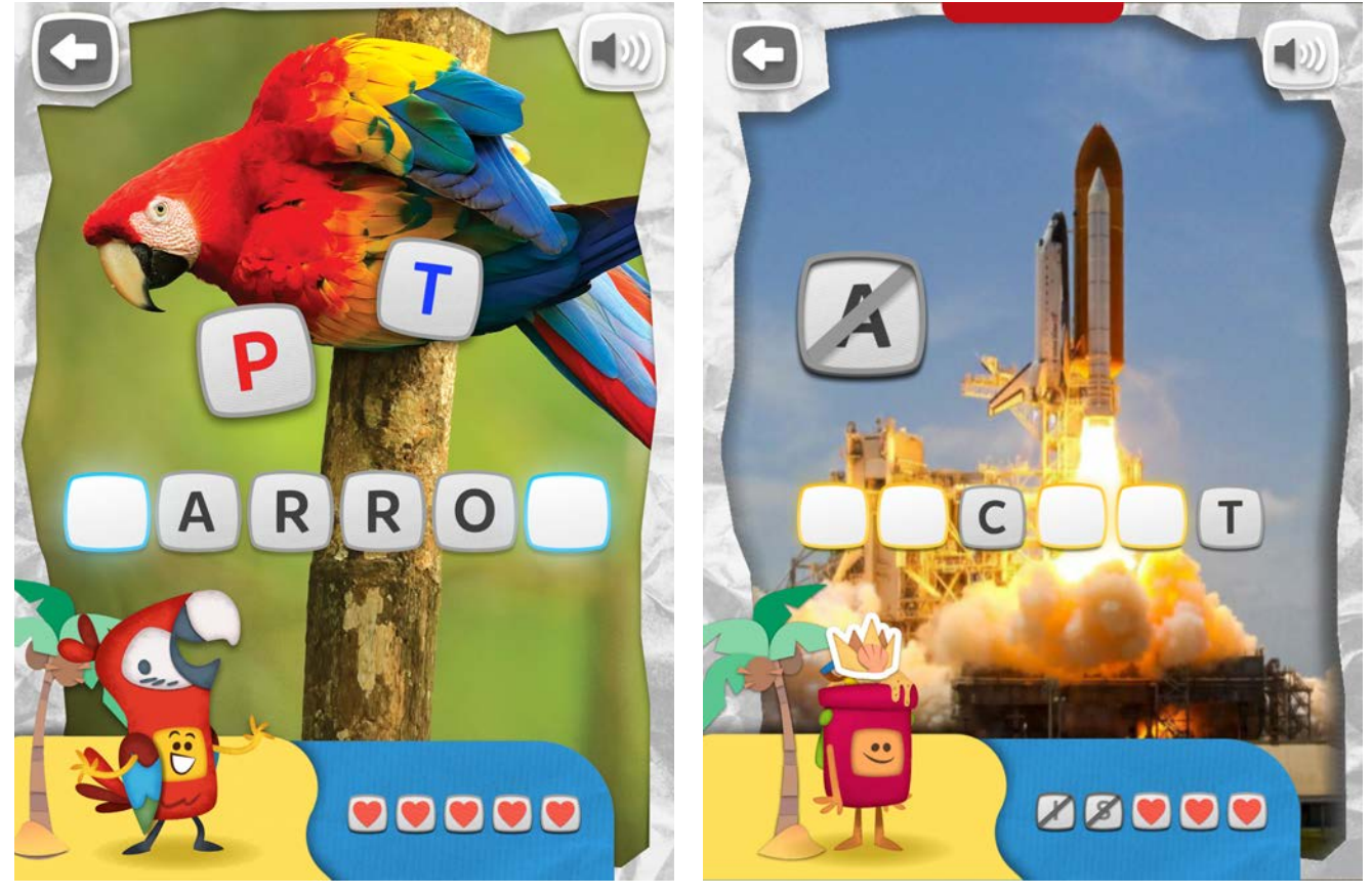
Correct letters will fall into the empty spaces in the secret word

Note: At the start of each challenge, the word is spoken aloud. Having your audio on will help sounding out tricky words.