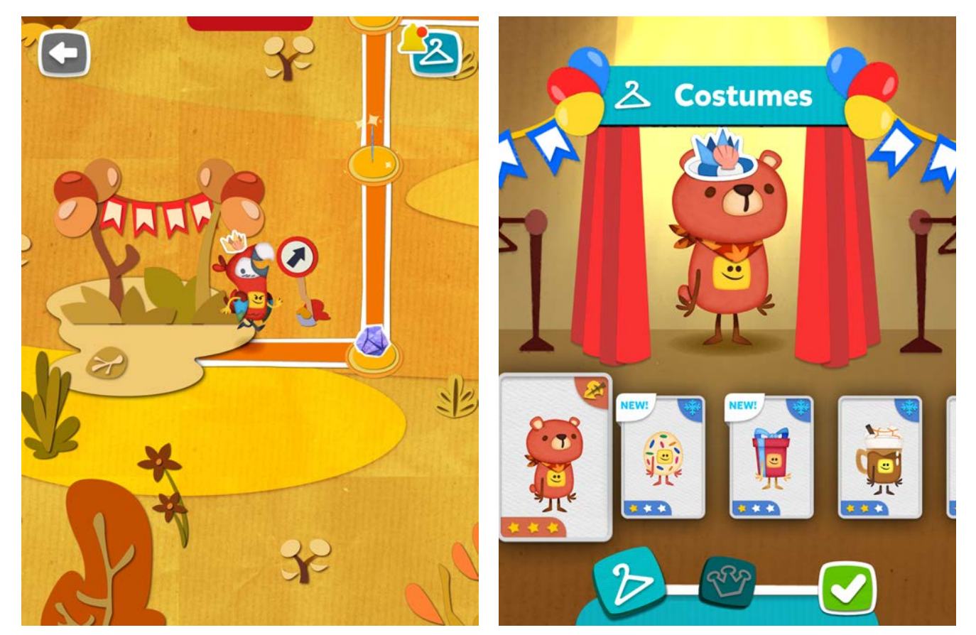
Customization button is at the top left.