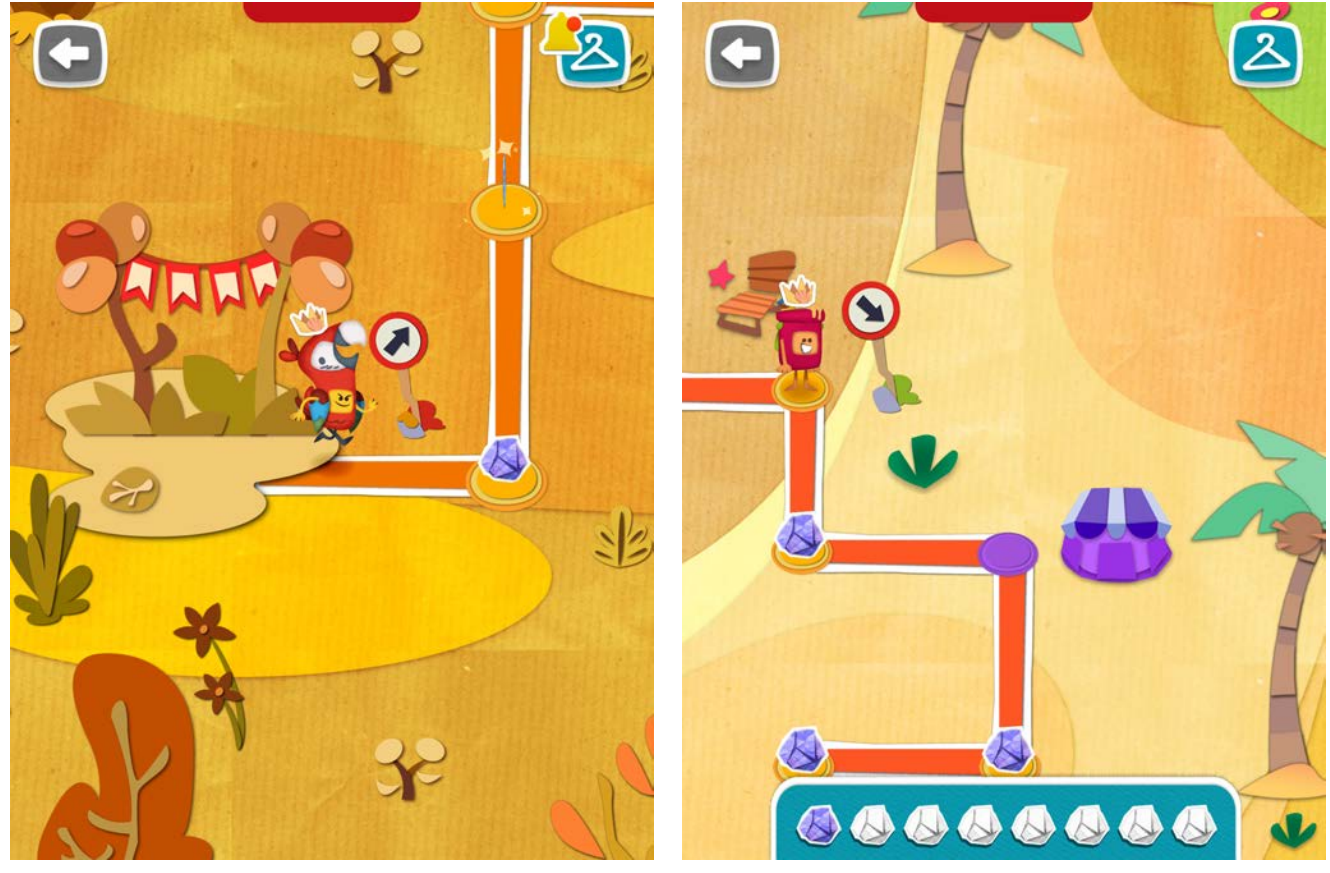
Spelling Challenges are scattered everywhere across the maps.

Note: The more spelling challenges you win, the more chances you earn to play the minigame.