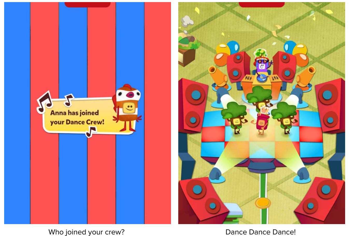
Dance Dance Dance!

Note: New Dance Crew members are always wearing the coolest costumes and will show you ones you may or may not have unlocked yet.